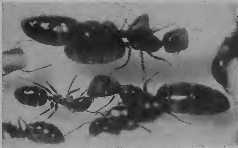
Figure 1. Portion of a laboratory colony of Camponotus (Colobopsis) fraxinicola housed in a glass tube. The large soldiers use their cylindrical heads to block the circular nest entrances, which are cut by the minor workers. This colony has been fed ad libitum, and consequently both soldiers and minor workers are in replete condition. In the center, a soldier and minor worker exchange food by regurgitation.

When twigs containing fraxinicola colonies are first broken open, both minor workers and soldiers rush out. Many attack any accessible alien object, such as the observer's hand or a bit of cloth offered to them, biting it and spraying it with formic acid. The same response was obtained in the laboratory by permitting fire ant workers ( Solenopsis invicta ) to invade the nests. Individuals of both castes were about equally aggressive and effective in repelling these invaders. On the other hand, the total population of minor workers, by virtue of its greater size, was more effective than that of the soldiers.